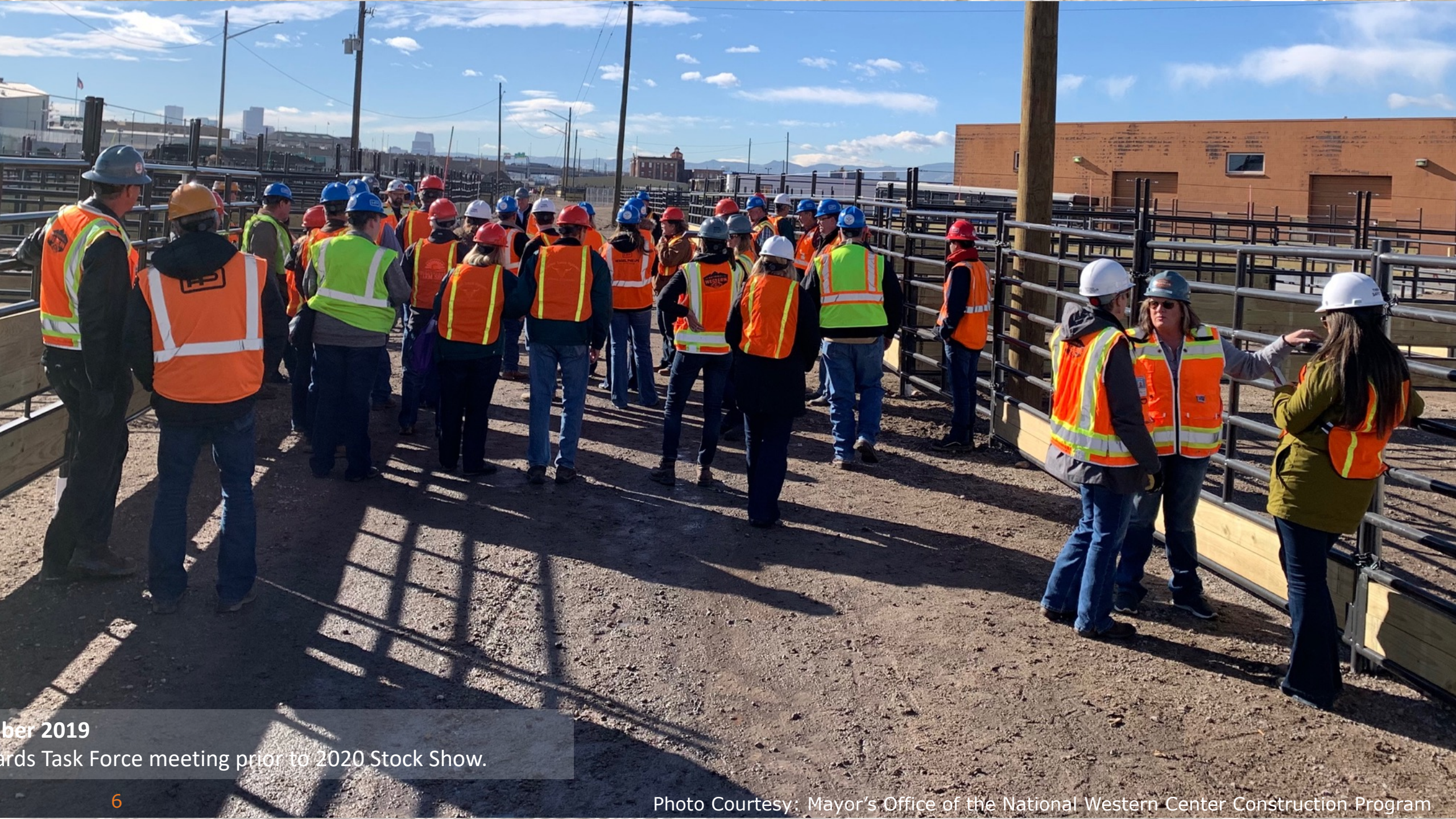
ber 2019 ards Task Force meeting prior to 2020 Stock Show.